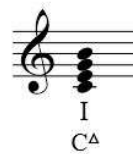
Fig 10. Vertical harmony

In Fig 10 we think of each note that builds the chord (eg 1,3,5,7) - vertically